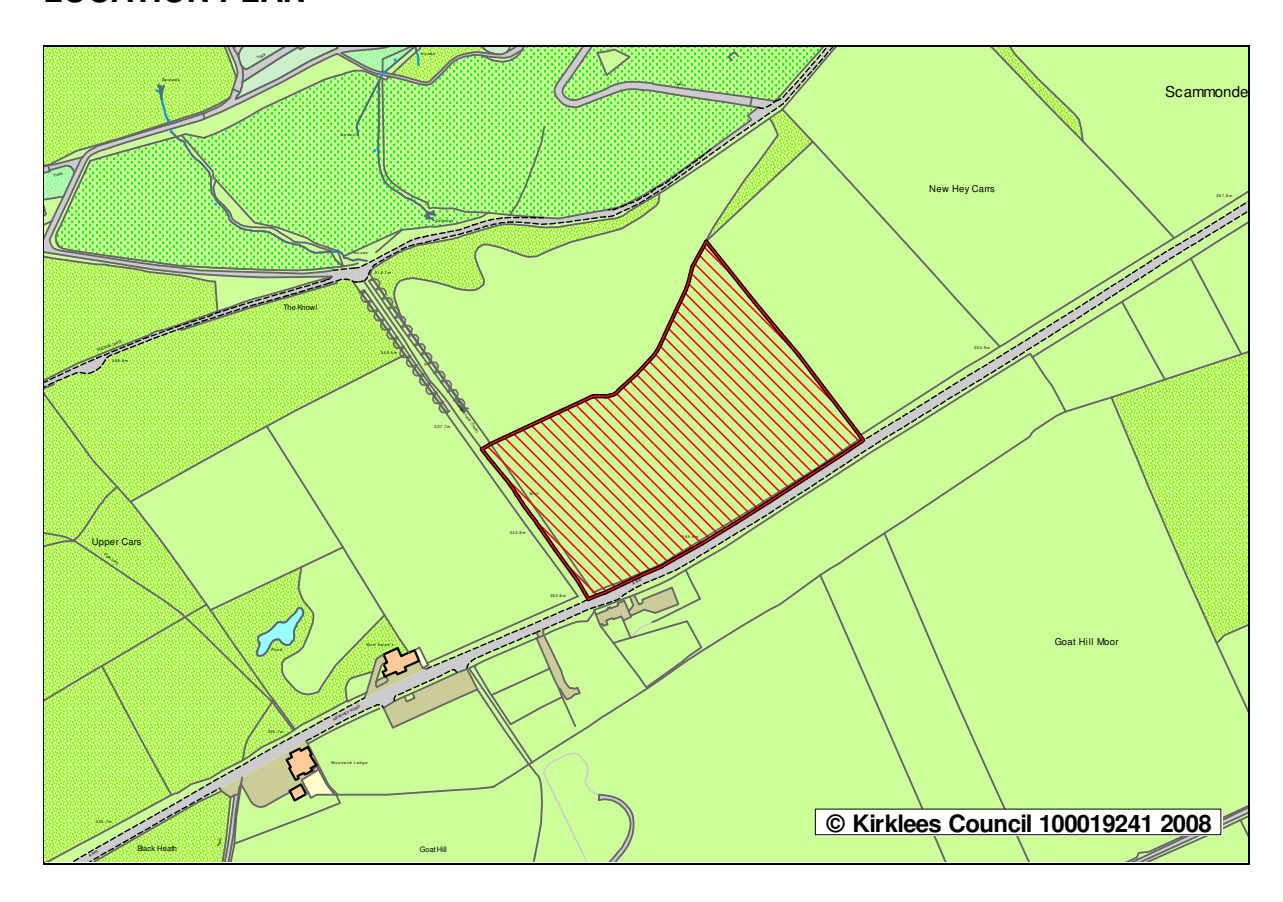
Map not to scale - for identification purposes only